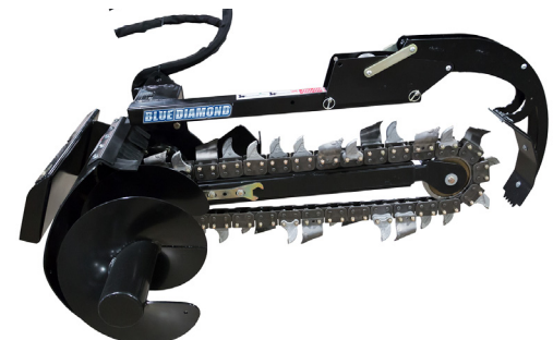
Mini - Machine