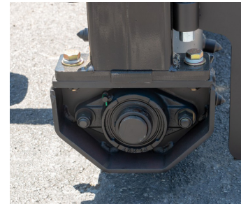
Heavy duty protected bearing