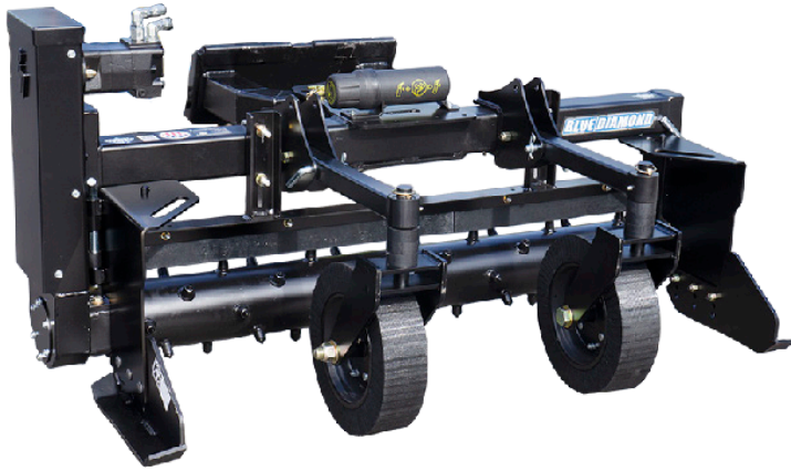
Shown with fixed teeth option.