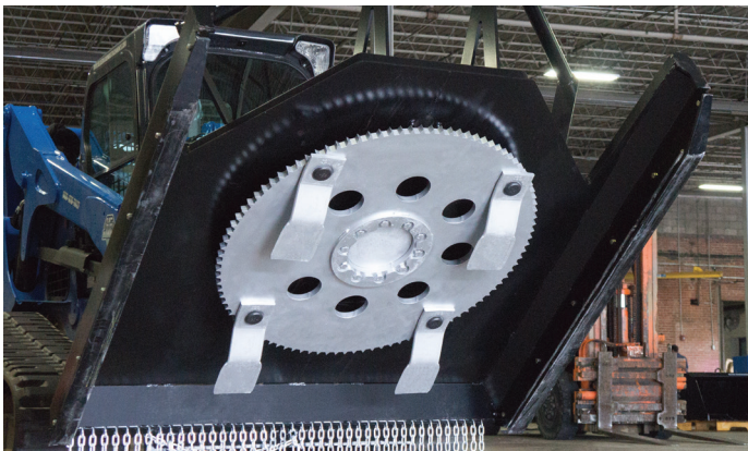
500 LB BLADE CARRIER