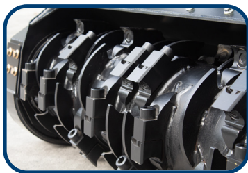
Four Position Anvil Tooth