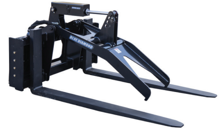
SEVERE DUTY MAT GRAPPLE